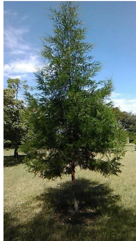
Grand Secretary's Tree