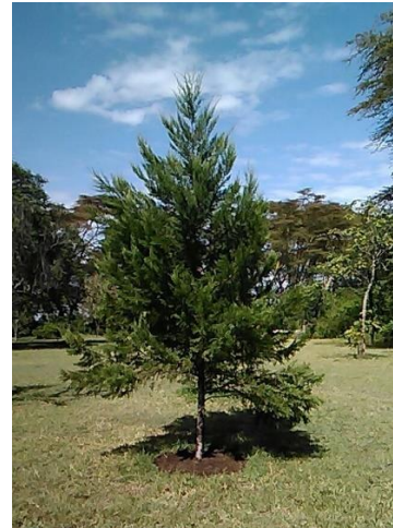
Depute GM's Tree