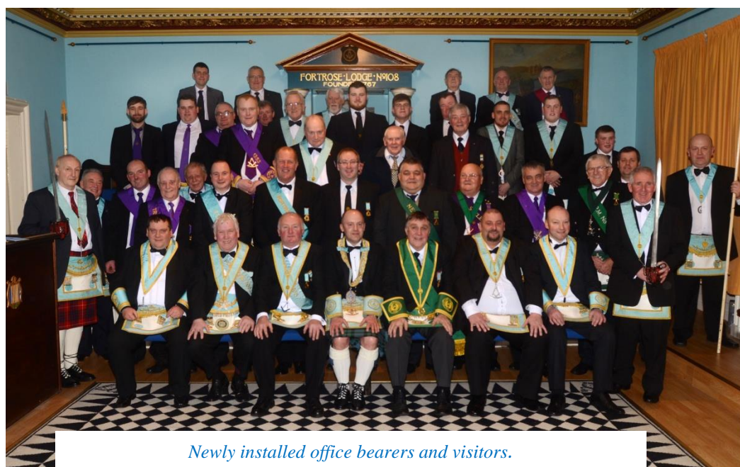
Newly installed office bearers and visitors.